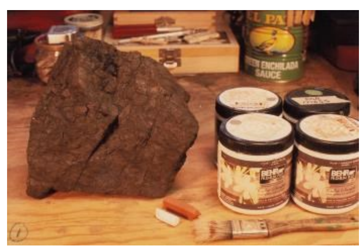
This Started As A Pure White Rock Found In Some Bushes. It Has Been Painted With A Heavy Black Wash