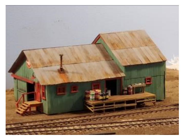
Oil Warehouse In Proberta