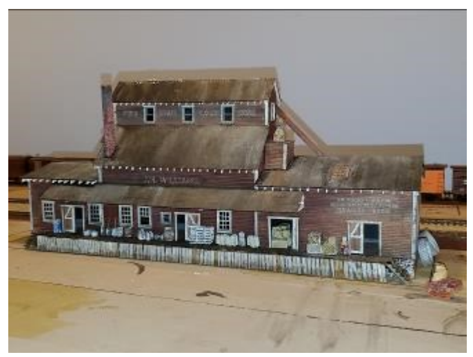
Feed Mill In Red Bluff