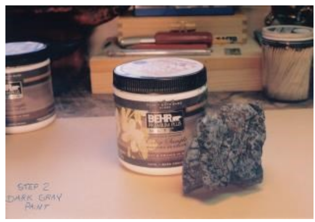
Step 2 - Dark Grey