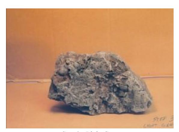
Step 3 - Light Grey