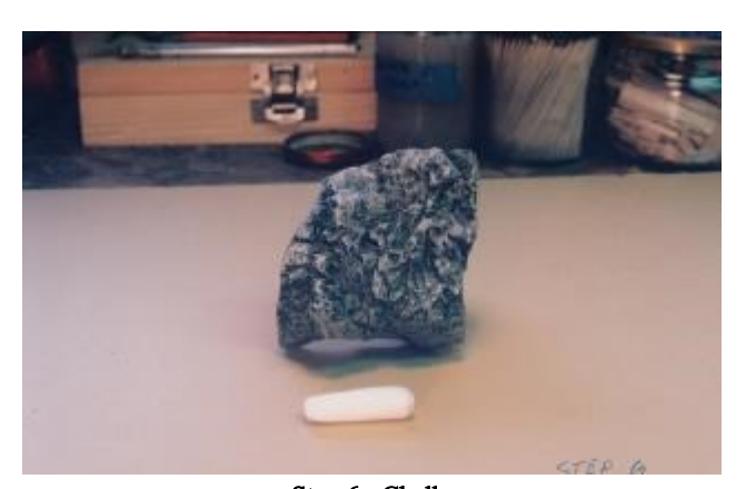
Step 6 - Chalk