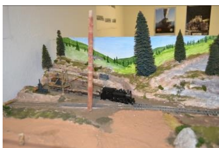
The Pole Created And Set In Place

"Spar Pole" from page 1 With the landscaping blended into the original layout, the real project – the creation of the Spar Pole and Hayrack Boom with all of the attendant equipment began. I started with an KMP Spar Pole kit that I acquired some time ago, but as I ultimately intend for that to be installed on the Hastold, Tuyred & Betapon, I decided to scratch build all of the pole and its rigging.