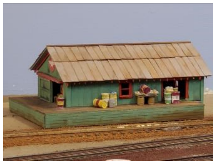
Oil Warehouse In Redding