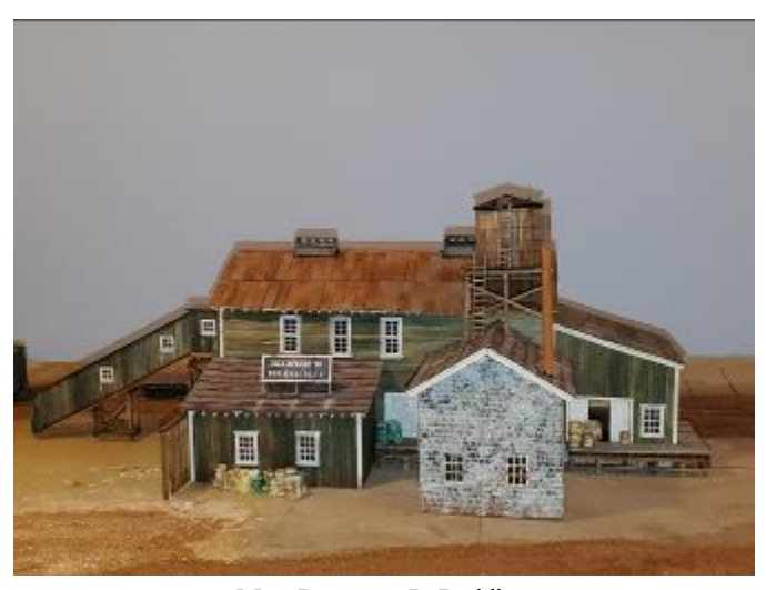
Meat Processor In Redding