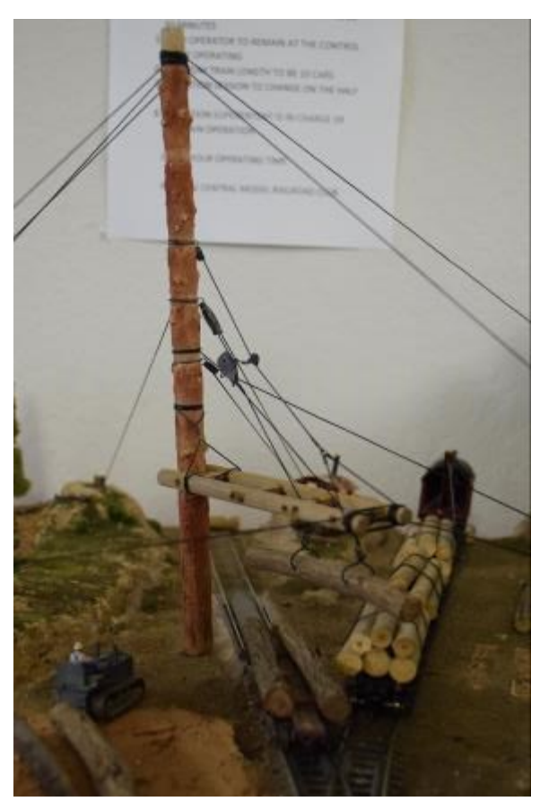
Early Overview Showing The Stump Field And Some Of The Cable Settings/Tie-Offs