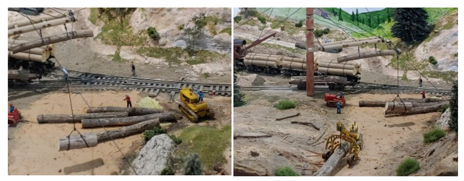
Views Of The Tractor Operation And The "Squirrel", Or Dead Weight Returning The Boom To The Pickup Position