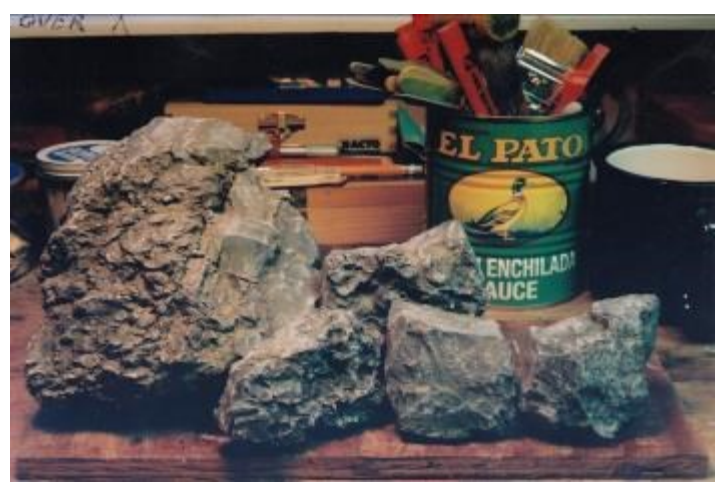
Assortment Of Real Rocks Painted And Ready For Installation. One Is Hand Carved From Foam (guess which one!)