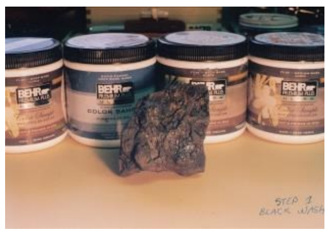
Step 1 - Black Wash