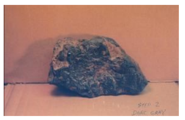
Step 2 - Dark Grey