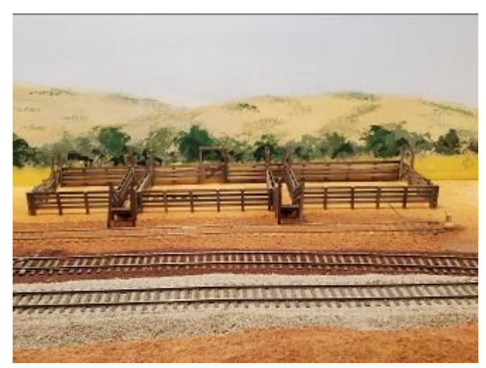
Proberta Stock Pens