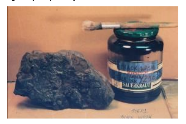
Step 1 - Black Wash

It can be a lot of fun to experiment with all the different techniques of making rocks look realistic and it will greatly improve your skills as a modeler and an artist. Fred Flintstone would be surprised.