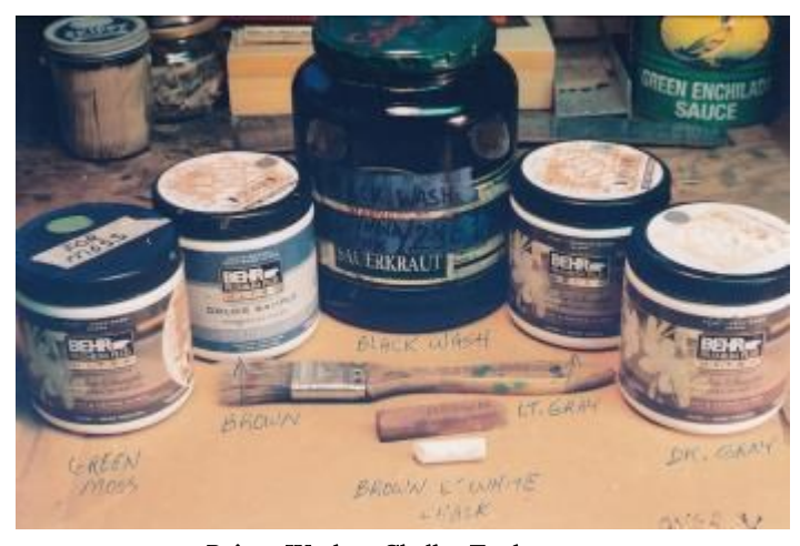
Paints, Washes, Chalks, Tools