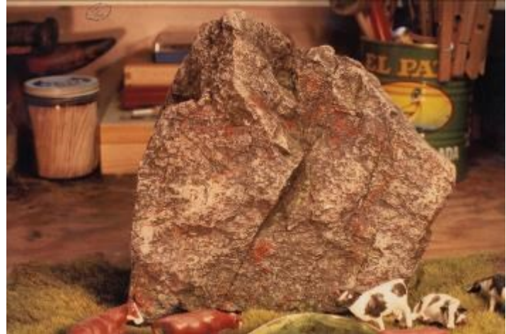
The Same Rock Shown At Left After Using All The Techniques Described Above