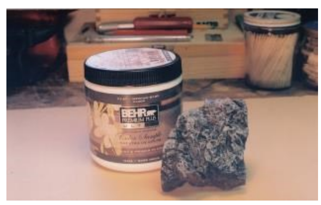
Step 3 - Light Grey