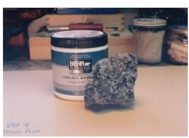
Step 4 - Brown