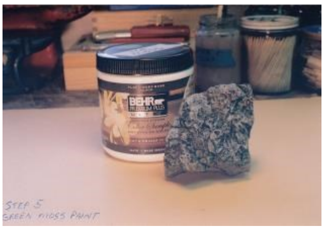
Step 5 - Green Moss