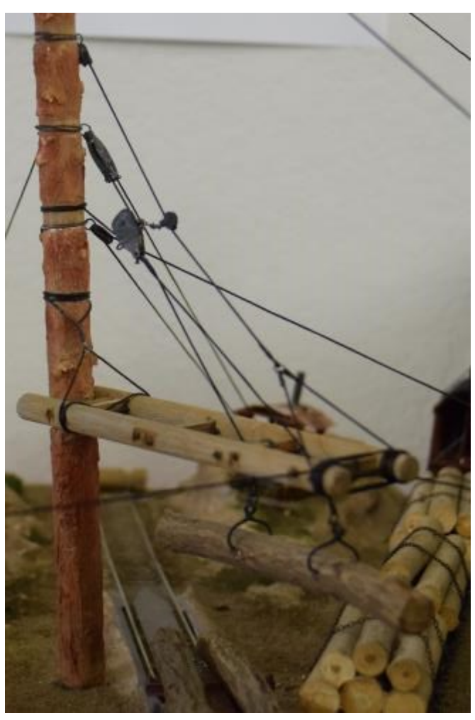
All Of The Blocks, Pulleys And Carriages On The Pole And Boom, Including The Log Tongs, Were Scratch Built From Styrene