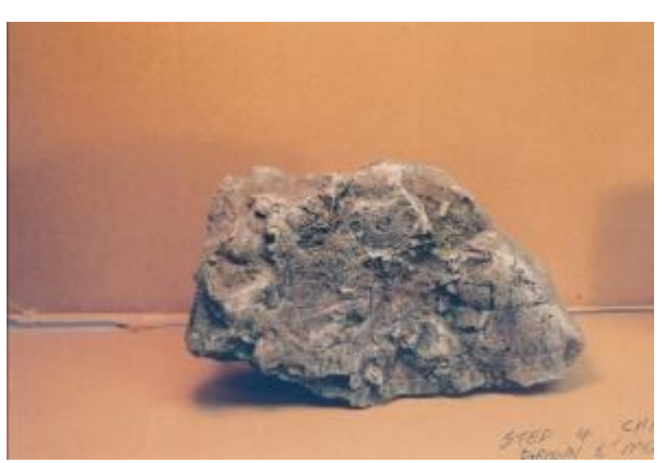
Step 4 - Brown & Moss