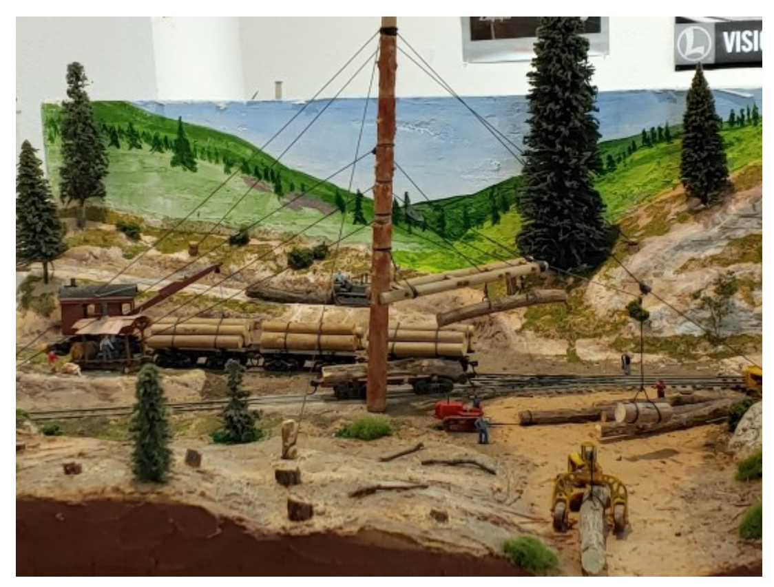
Overview Of Installed And Populated Log Landing And Loading Scene

The project took several months from start to finish, but it has turned into an attraction on the layout during our periodic open houses and for visitors who are interested in logging operations on their own layout.