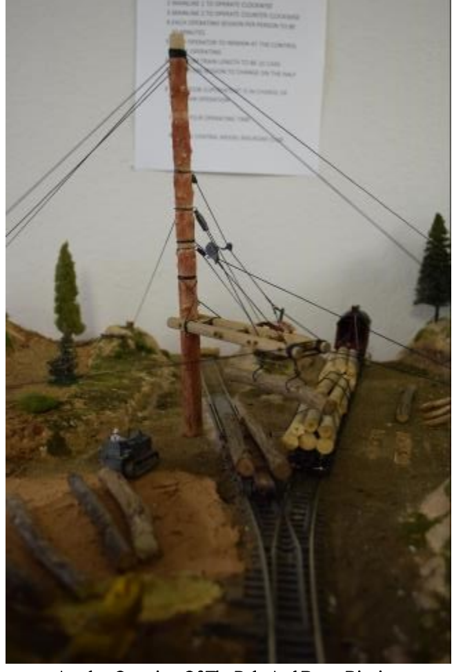
Another Overview Of The Pole And Boom Rigging