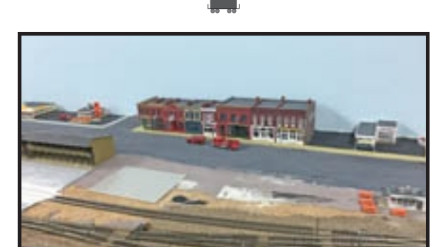
The central scene is this row of commercial storefronts.

Until next time, may all your signals be green, and all your trains be on schedule!