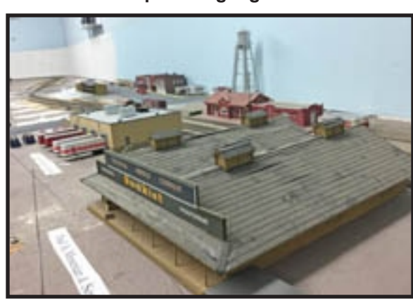
Further to the right are the freight depot and the Sunkist packing plant.