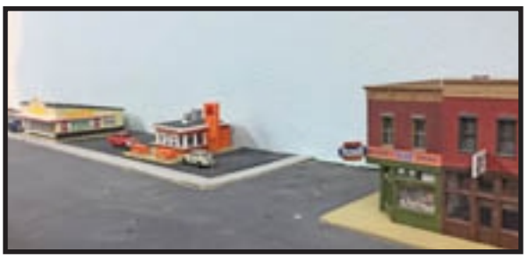
Zooming in on the stores shows Doug's petite signage.