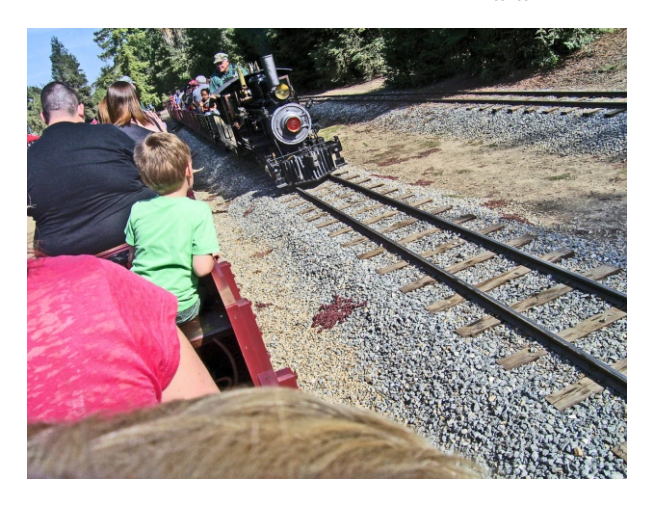
"Meets" like this are common on the Hillcrest & Wahtoke during holiday operations.

A revised budget will be prepared next month to reflect speakers cost and any other expenses that need to be addressed.