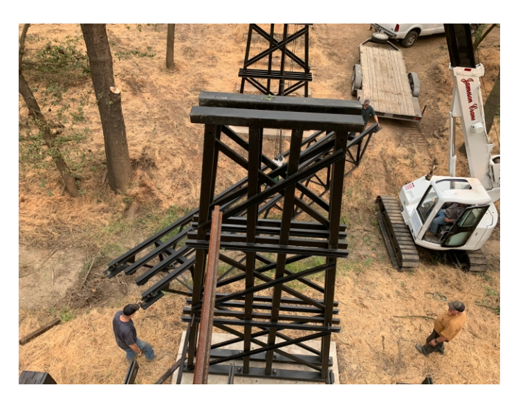
Recent construction activity on the Hillcrest & Wahtoke RR saw the erection of a trestle across Wahtoke Creek.