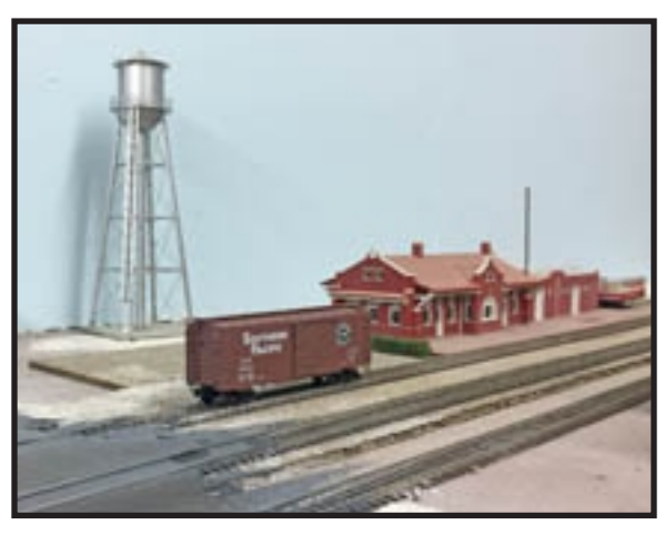
Looking to the right you can see Doug's passenger depot and water tower.

Oh, and about that lesson for today, you can also add 'motivated.' First off, I got motivated by sitting in and chatting with other model railroaders and now I set goals each week—between ZOOM meetings—to get