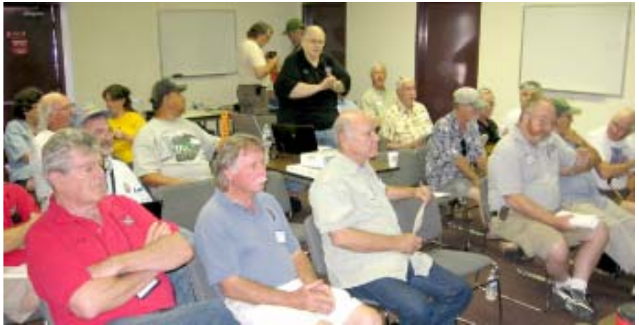
Attendance was quite good especially because Dave personally invited our new members from the X2011 convention.