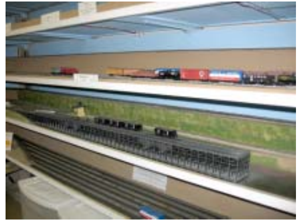
Exhibited here are four of the seven layers of Gary Saxton's around the room spiralling layout.