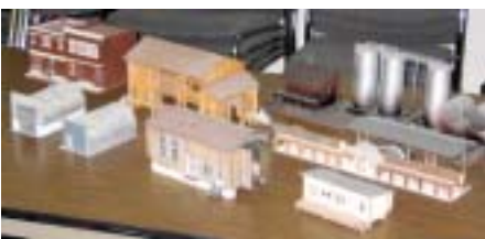
Members models display. These are a sampling of scratch built back-ground or place holder buildings in HO Scale by George Pisching.