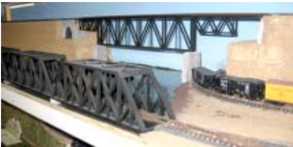
Gary's NYO&W layout has many bridges as did the prototype.