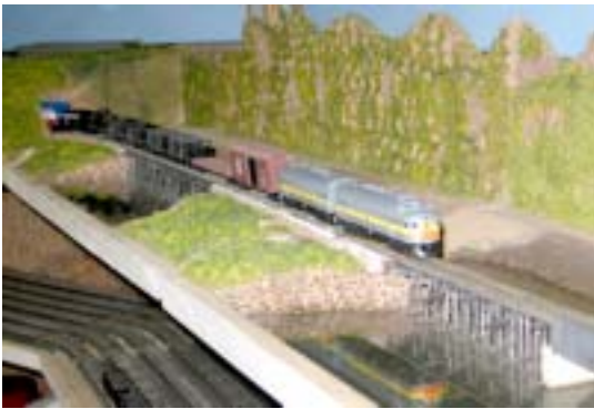
An O&W freight runs in front of the palisades along the river front on Gary Saxton's N scale layout.