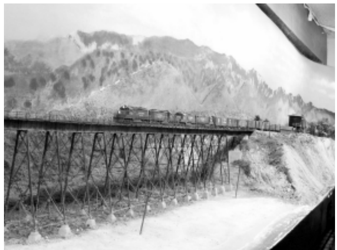
No, we didn't have a field trip to Gaviota, That's Charlie Burns' layout at Morro Bay, in N Scale!