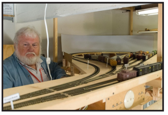
Truckee Yard in 2021