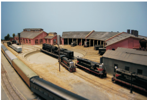
Dunsmuir Terminal on Larry Saslaw's SP Layout

Want your ad in the Obs? Send a business card along with a check for $40.00 and we'll print it for the next four issues. See the Obs Editor's address on the back page, or give your card and check to him at a meet.