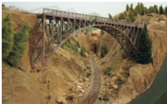
Canyon scene on the Goshen and Goosechase

Sign-ins and morning refreshments will be available at 9:30 and we