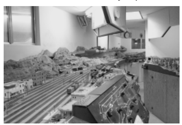
Mel Norwood's HO Grand Canyon Railroad