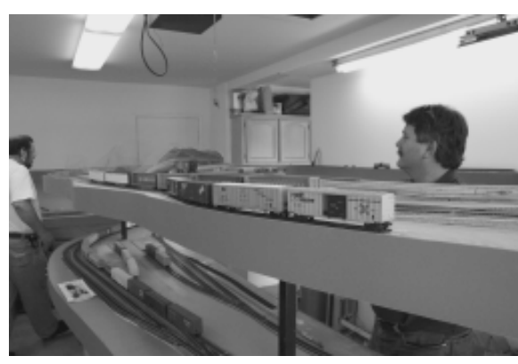
Rob Briney's Fresno Industrial Layout