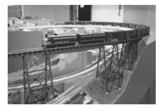
Chuck Harmon's San Joaquin Central