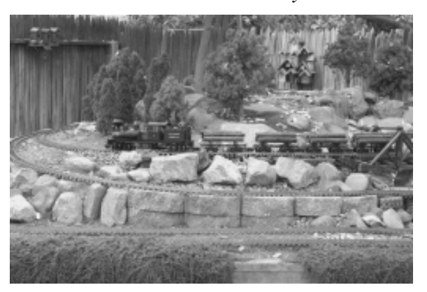
Dick Paris' G scale garden railroad