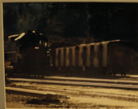
P2 LAST Roundup

2nd Place was Patrick LaTorres' Last Roundup