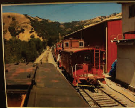
LOOKING OUT OF THE CAB, SUBSEQUENT TO BEING UP ON THE TRACKS. THE TWO AT&SF CABOOS CLASS 4871 CABOOS IN THE FOREGROUND. BRIGHTSIDE, NILES CANYON RAILWAY.

1st Place was Eugene Brichacek's Cab Shot of Two AT&SF Cabooses on the Niles Canyon Railway at Brightside;