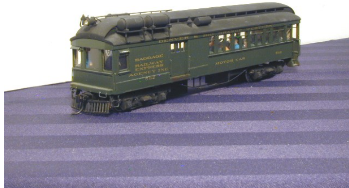
D&RGW Motor Coach #592