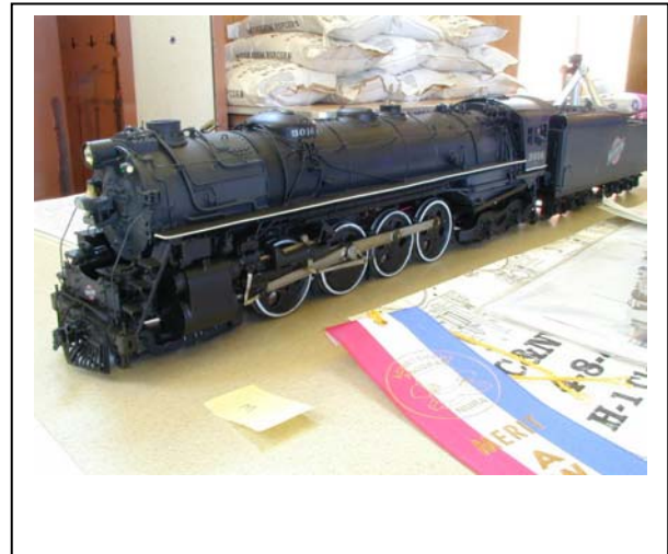
2 nd Place September Alf Modine