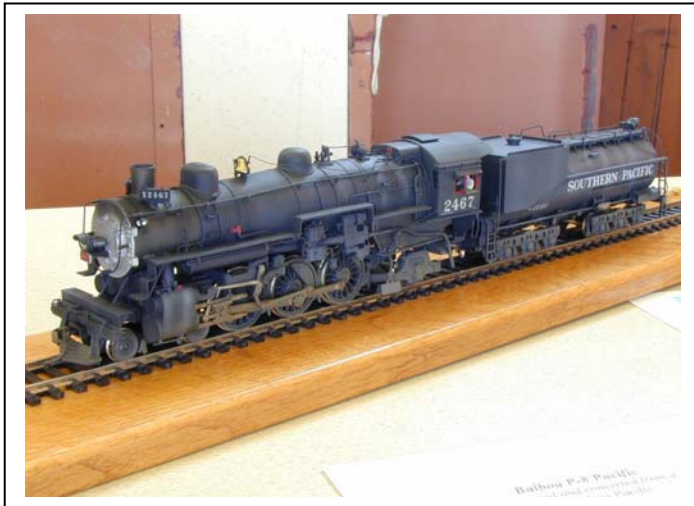
1 st Place, September Mark Schutzer