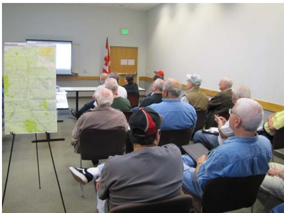
Clinic on the Clayton Branch