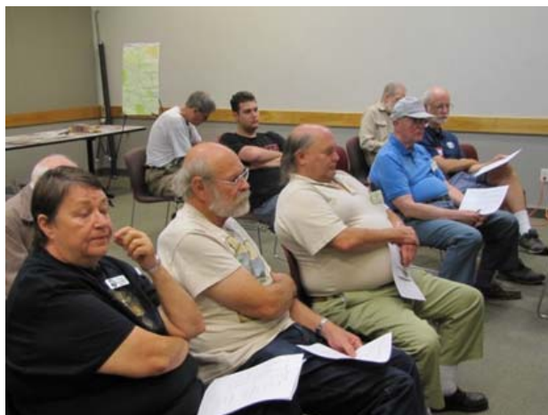
Clinic on scale and gauge.