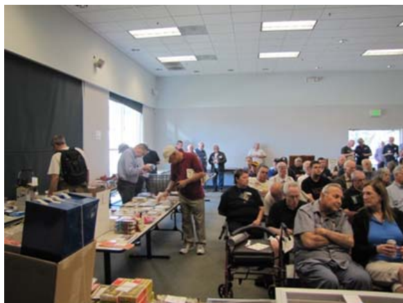
Some of the 400 Plus Auction items