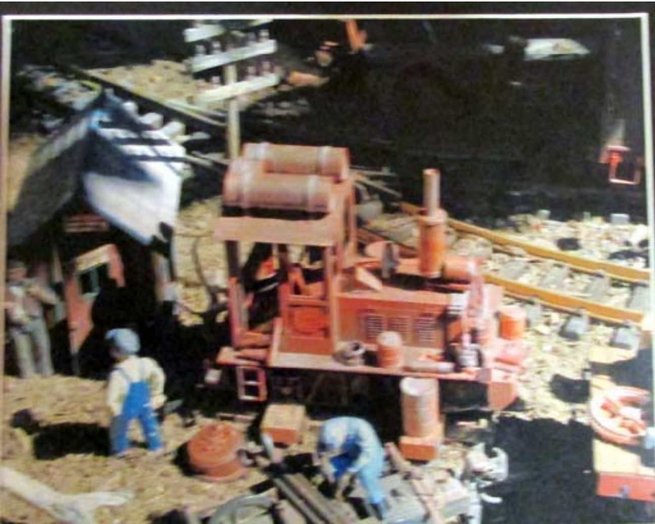
1 st Place — Pat LaTorres’ Shop Crew